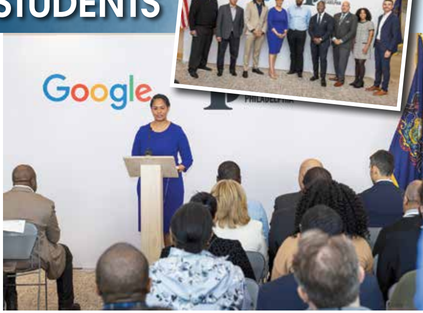
I am beyond excited to see the results of this partnership and new opportunity for Philadelphia students.

This initiative represents a landmark moment for education and employment in Philadelphia. The partnership also represents progress in our efforts to prepare Philadelphia residents for the future work in technology and beyond.